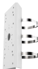
DS-1275ZJ-SUS Vertical Pole Mount