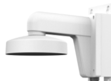
DS-1273ZJ-130B Wall Mount