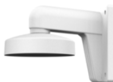
DS-1273ZJ-130 Wall Mount