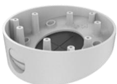
DS-1281ZJ-DM23 Inclined Ceiling Mount