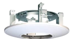
DS-1227ZJ In-Ceiling Mount